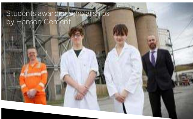
Students awarded scholarships by Hanson Cement