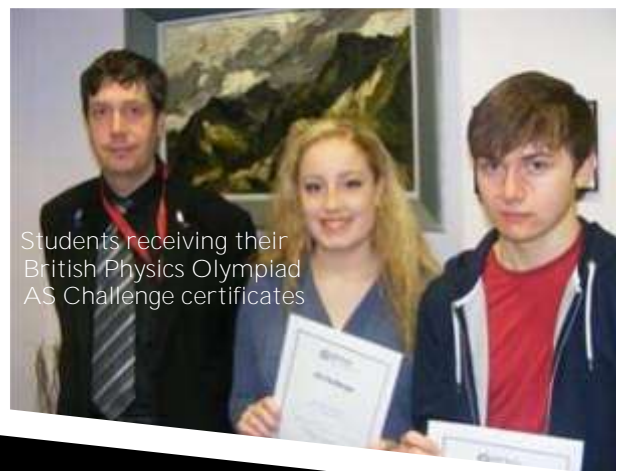
Students receiving their British Physics Olympiad AS Challenge certificates